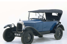
CITROËN C3 5HP (1922-1926) Les Dossiers documentaires du Conservatoire CITROËN

A collection by subject which has been enriched